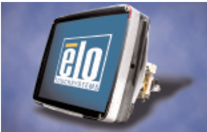
Touch the itouch tube directly— no touchscreen overlay needed

Find out more about Elo's extensive range of touch solutions. Go to www.elotouch.com , or simply call the office nearest you.